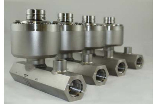
LIQUID SIZE SELECTOR CHART FOR HO SERIES SUBSEA TURBINE FLOWMETERS

Our flowmeter expertise has enabled us to supply flowmeter solutions for BOPs, ROVs, wellhead additives, subsea production systems and a variety of other subsea flow applications. With more than 40 years in the flowmeter business, we continue to set the standards for accuracy, reliability, durability, economy and integrity. In fact, no other company offers you more flow measurement solutions for subsea flow applications than we do. Put us to the test, and find out how Hoffer turbine flowmeters can resolve your challenging subsea flow applications.