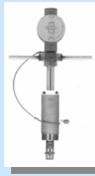
*NPT/Low Pressure Adjustable